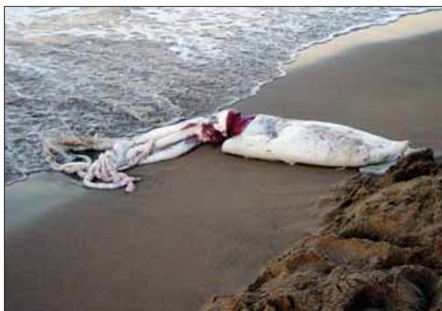
Figure 1. A giant squid ( Architeuthis dux ) carcass on a beach in Spain.

exploitation) in the marine environment (Marine Mammal Commission 2007). In addition, the potential increase in ambient sound levels will not affect all areas equally, but will differentially impact specific regions where offshore activity is high (eg some of the Exclusive Economic Zones; see OSPAR Commission 2009). Potential effects might not be proportionate to noise pollution levels due to variation in sound propagation and, most importantly, the distribution of marine organisms that are sensitive to sound.