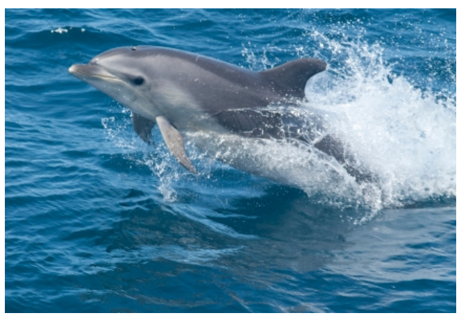
Bottlenose dolphin from the Atlantic AMAPPS study.

that at some point where an air gun has been used, an animal could have been injured by getting too close. Make no mistake, airguns are powerful, and protections need to be in place to prevent harm. That is why mitigation measures -- like required distance between surveys and marine mammals and time and area closures for certain species -- are so critical.