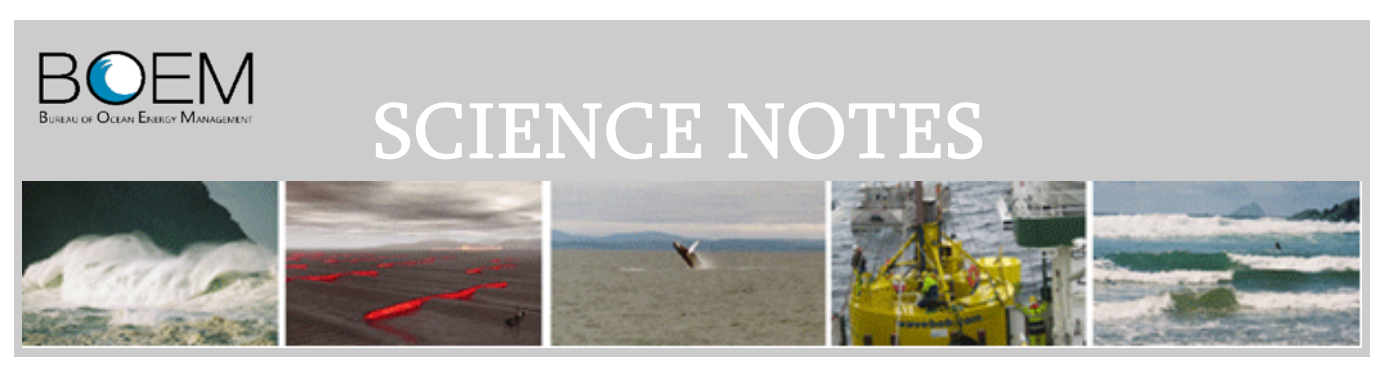
Applied science for informed decision making