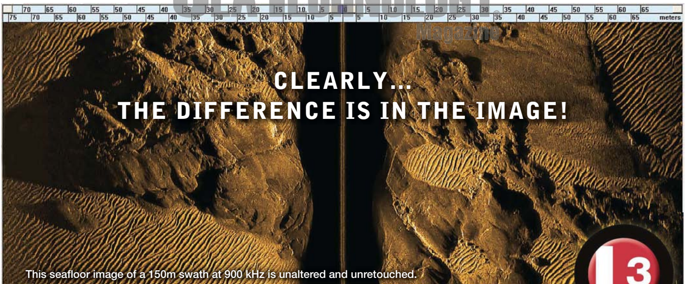
This seafloor image of a 150m swath at 900 kHz is unaltered and unretouched.