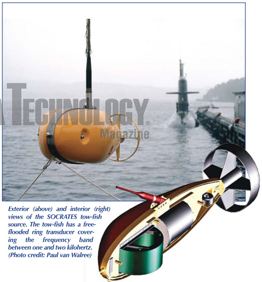
Exterior (above) and interior (right) views of the SOCRATES tow-fish source. The tow-fish has a free-flooded ring transducer covering the frequency band between one and two kilohertz.

Several potential benefits have been identified for CAS. Continuous transmission leads to continuous illumination of a target. It provides more detection opportunities and is therefore likely to increase the probability of detection. For maneuvering targets, for example, a broadside glint could appear only during a short period during a maneuver. It is therefore