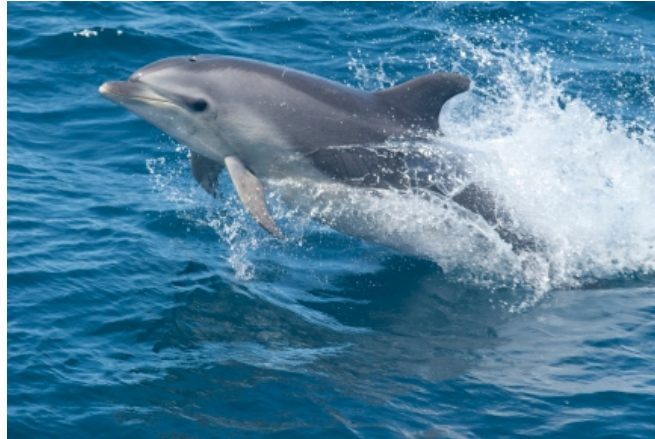
Bottlenose dolphin from the Atlantic AMAPPS study.

To date, there has been no documented scientific evidence of noise from air guns used in geological and geophysical (G&G) seismic activities adversely affecting marine animal populations or coastal communities. This technology has been used for more than 30 years around the world. It is still used in U.S. waters off of the Gulf of Mexico with no known detrimental impact to marine animal populations or to commercial fishing.